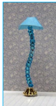
Wonky Floor Lamp Paula Isaacs

Supplies: A finding or bead for the base, seed beads, a small dab of air dry or polymer clay, and a 2" or so length of wire that's thin enough to thread the seed beads. Think floral, jewelry or electrical wire - the piece shown was snipped from a LED light.