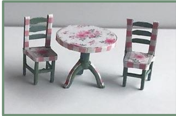
TABLE AND CHAIRS